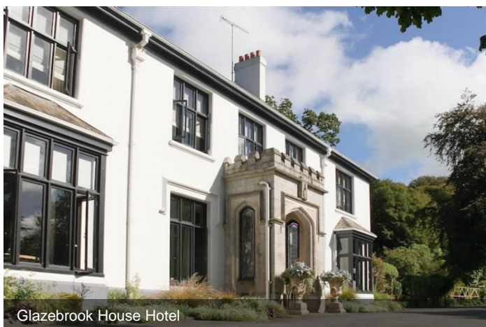
Glazebrook House Hotel