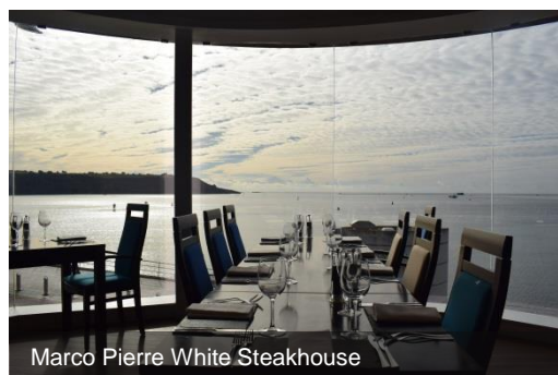
Marco Pierre White Steakhouse