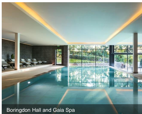
Boringdon Hall and Gaia Spa