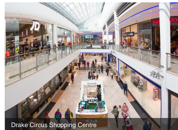
Drake Circus Shopping Centre