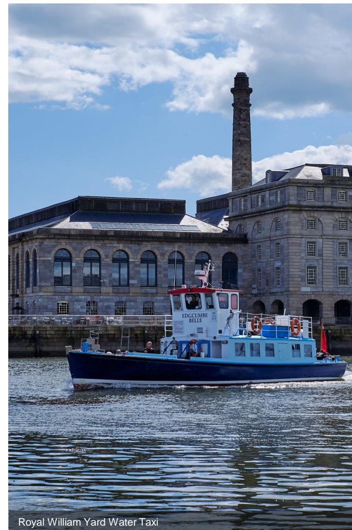
Royal William Yard Water Taxi