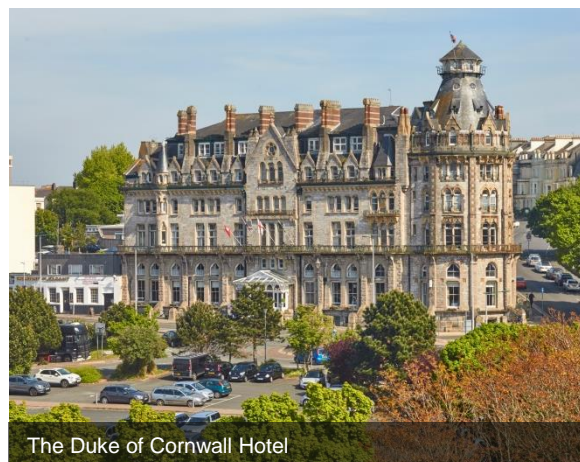
The Duke of Cornwall Hotel