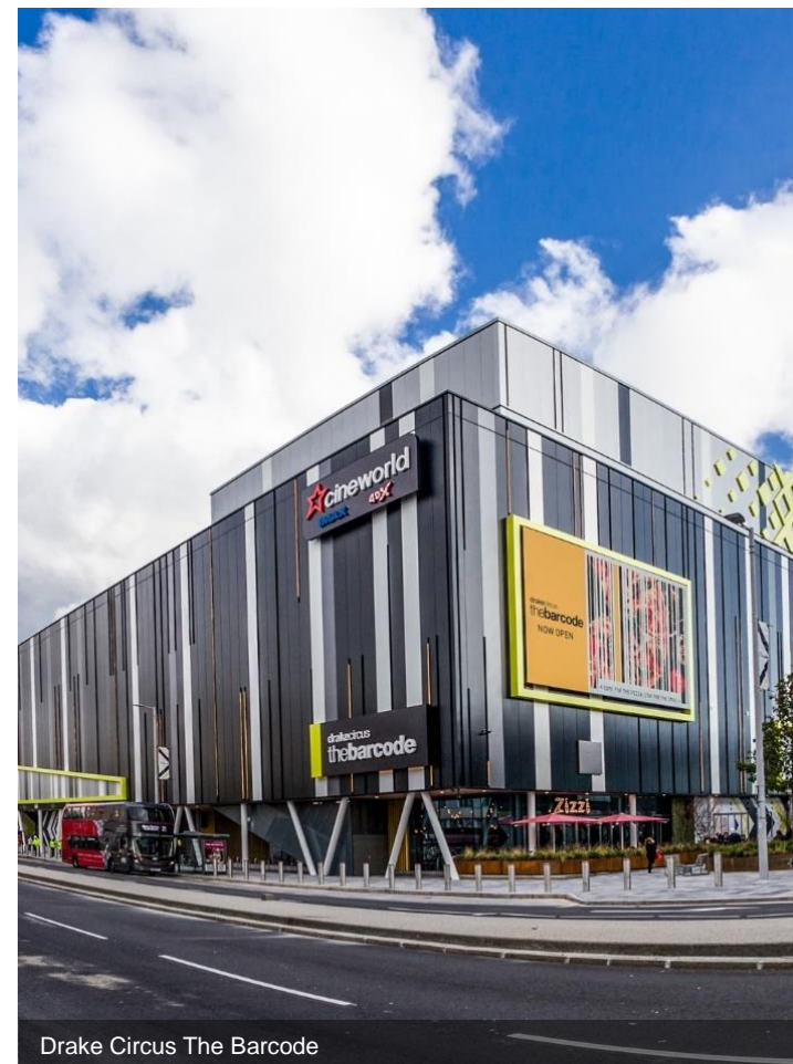
Drake Circus The Barcode

On the Barbican you can take the boat over and explore the Grade I gardens of Mount Edgcumbe, or sail the scenic Devon and Cornish coasts with Plymouth Boat Trips.