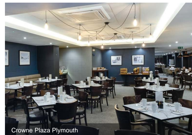
Crowne Plaza Plymouth