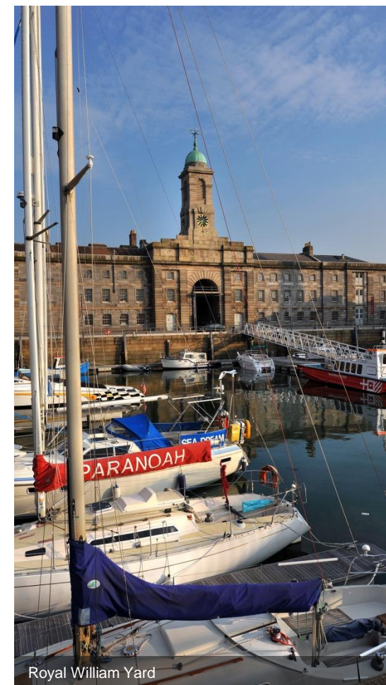
Royal William Yard

Find out more about what to see in Plymouth on our website here