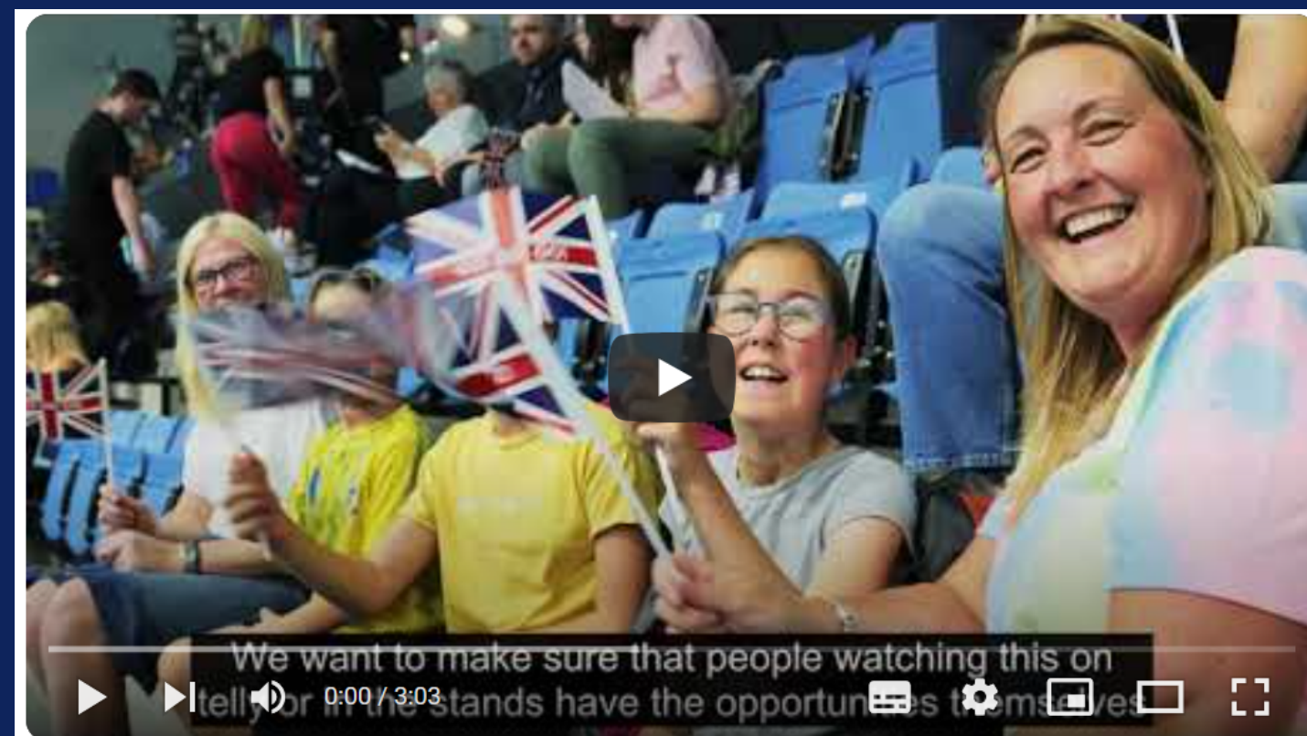
Manchester 2023 Para Swimming World Championships Social Impact Activity

With the support of UK Sport, we produced a short promotional film showcasing the work of the social impact programme for the Para Swimming World Championship. This video highlights the different activities developed and delivered across the three key themes of our social impact work.