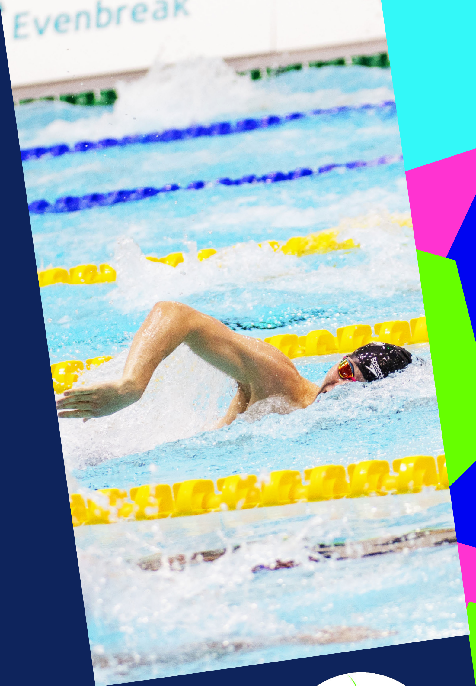
Alt: Image of swimmer competing at the Championships

GLL then joined delivery partners Everyone Active, Bamber Inclusive and Aquatic Life in delivering 182 Level Water classes over the summer holidays, supporting 33 children in the process.