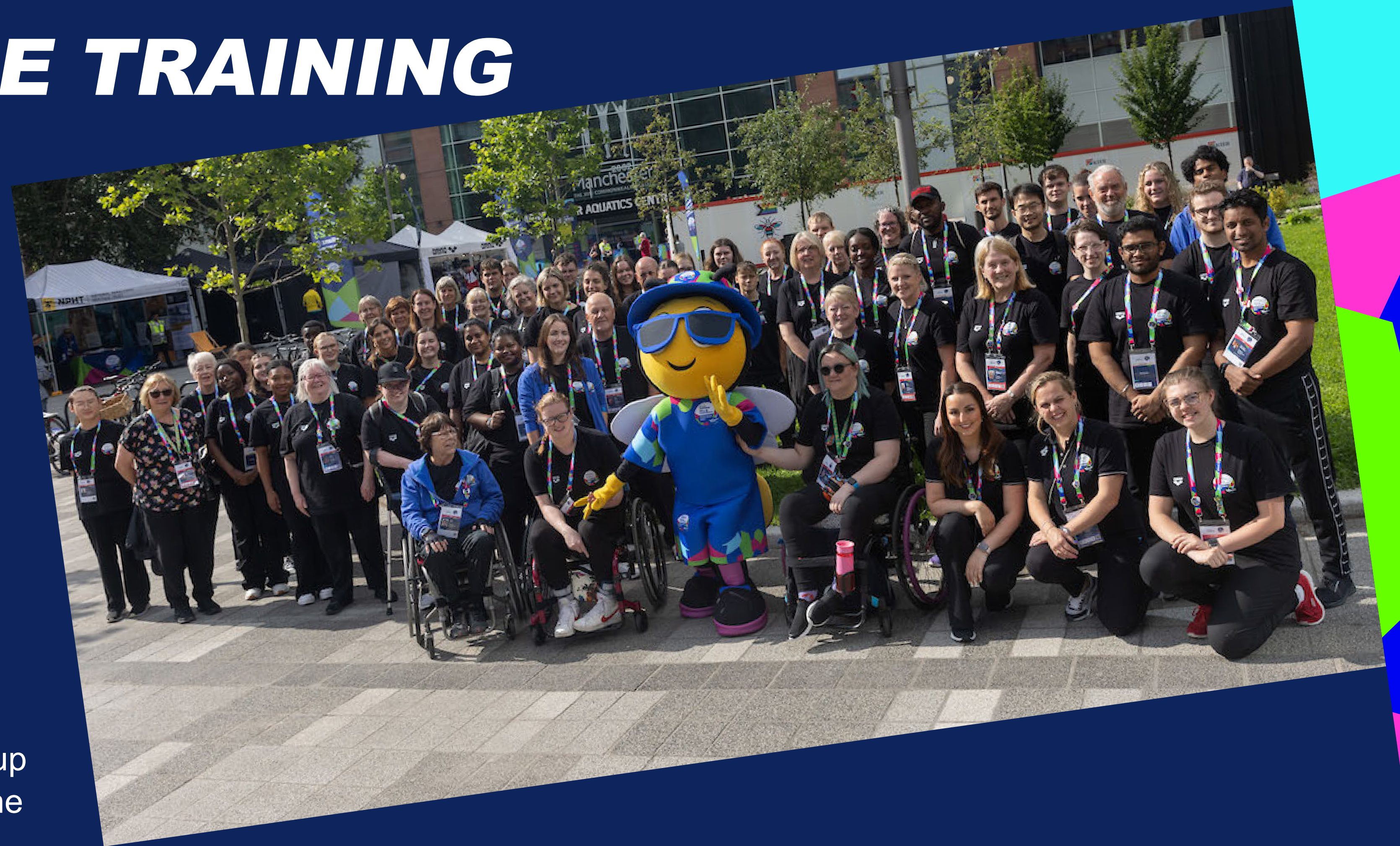
Alt: Image of large group of volunteers gathered outside of the Manchester Aquatics Centre with Championships mascot, Manny the Bee

Our feedback survey suggested that 88% of those who took the course agreed that it had better equipped them to support people with a disability at the Championships.