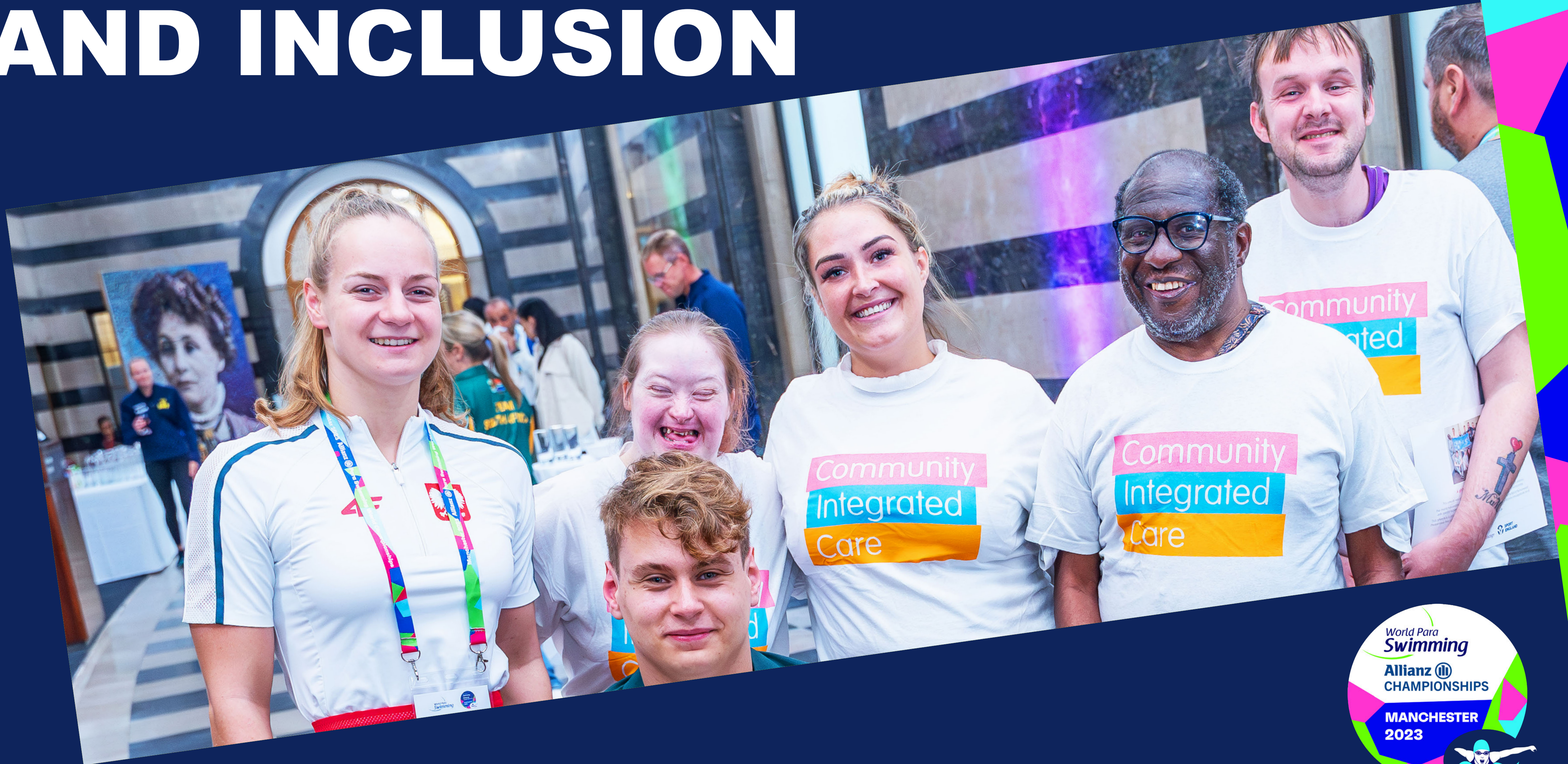
Alt: Image of a group of Community Integrated Care volunteers standing with guests at the Civic Reception at Manchester Town Hall