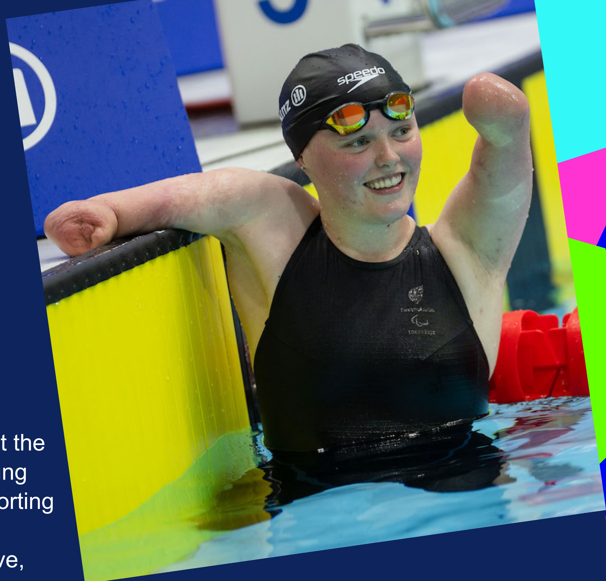
Alt: Image of swimmer Ellie Challis celebrating post race at the Championships

Managing multiple activities and partnerships proved to be complex but led to the delivery of a wide range of objectives, something that only an event of this nature could enable by bringing stakeholders and partners together.