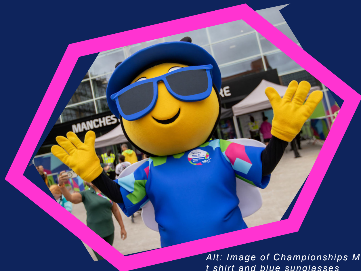
Alt: Image of Championships Mascot; Manny the Bee with blue t shirt and blue sunglasses