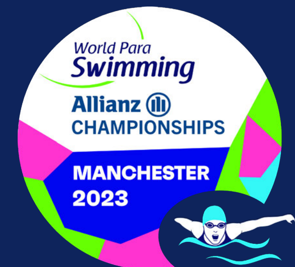
Alt: Championships logo