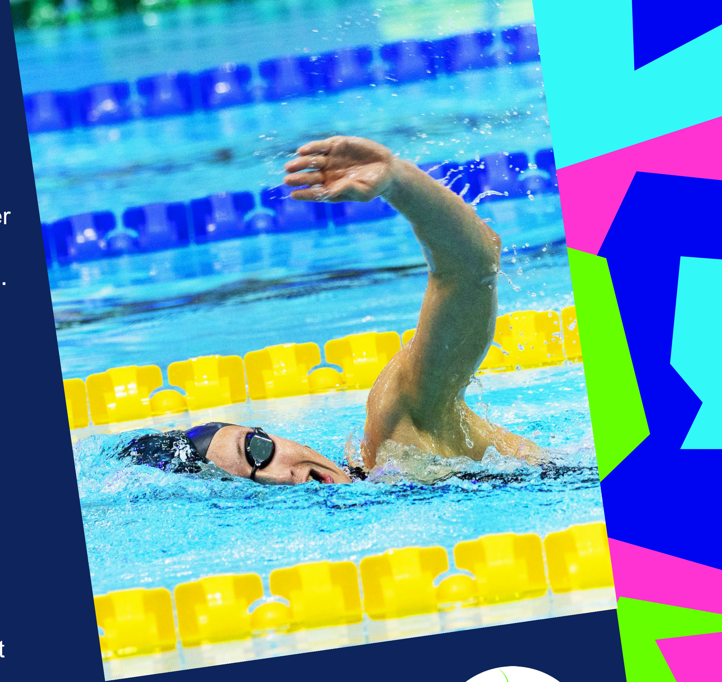
Alt: Image of swimmer competing at the Championships

The Institute has developed a unique programme which aims to support up to 12 candidates to gain swim teacher qualifications, leading to paid employment with local swimming delivery partners in Manchester and the city region.