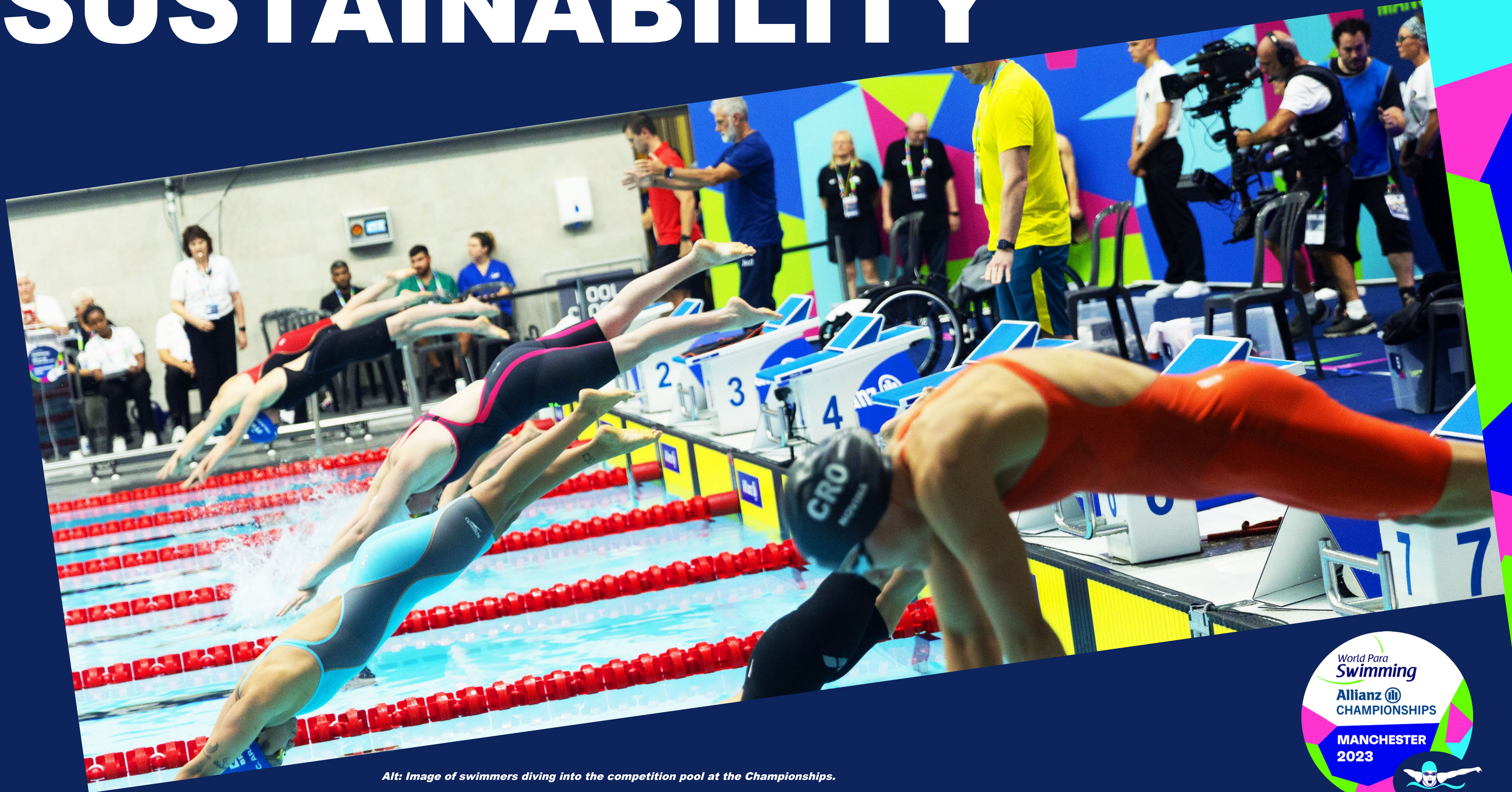
Alt: Image of swimmers diving into the competition pool at the Championships.