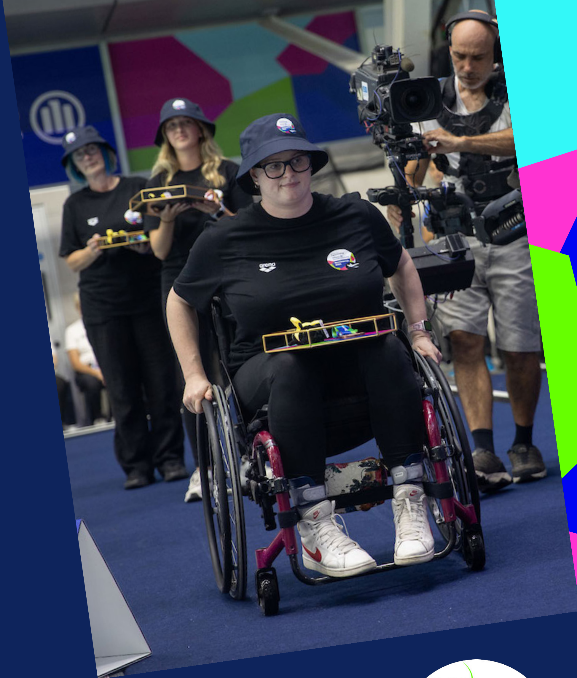
Alt: Image of a volunteer wheelchair user fulfilling a medal bearer role at the Championships.

MANCHESTER 2023 / SOCIAL IMPACT REPORT / EQUALITY, DIVERSITY AND INCLUSION