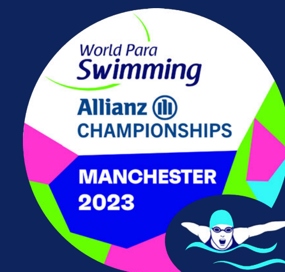
Alt: Championships logo